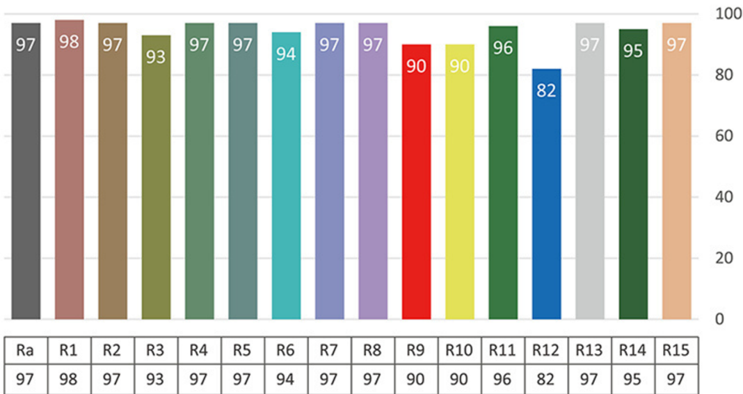
Fig 1 - Colour Rendering Index 4000K, CRI >95

The Color Rendering Index (CRI) serves as a metric to gauge how accurately a light source portrays the colors of various objects in a given space. Originally comprised of 8 sample colors, the CRI has expanded to 15 samples to provide a more comprehensive evaluation. Notably, within these samples, R9 to R15 focus on assessing special colors with high chroma. Specifically, R9 evaluates the rendering of red tones, while R15 is dedicated to evaluating the portrayal of skin tones. This extension of color samples, coupled with attention to high-chroma colors, enhances the precision in evaluating a light source's ability to faithfully reproduce a diverse range of colors.