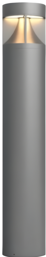
Robura Bollard Light