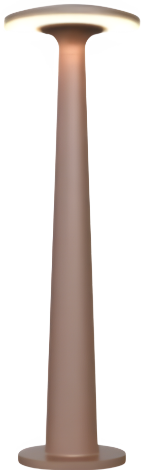
Capella Mushroom Light